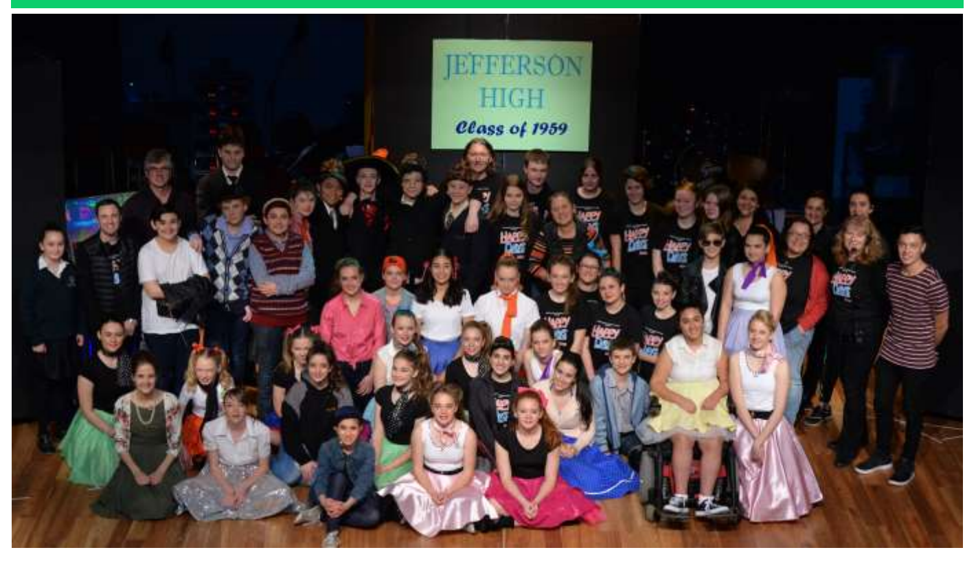
Congratulations to the cast and crew for a very successful 2016 Musical Production—Happy Days